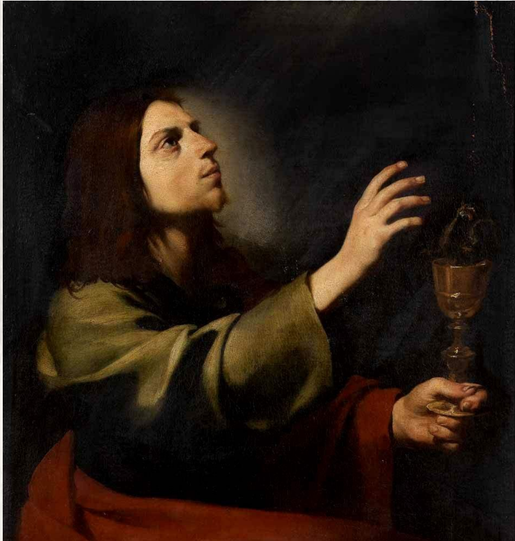
Jusepe de Ribera [1607-1608] Louvre, Paris [Baroque period]

[past history] [still future] [still future] [still future] [past history]