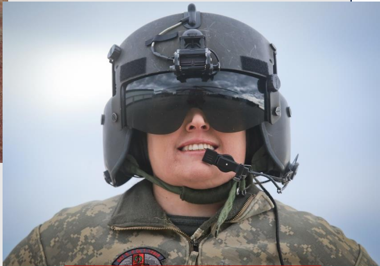
Hair like woman