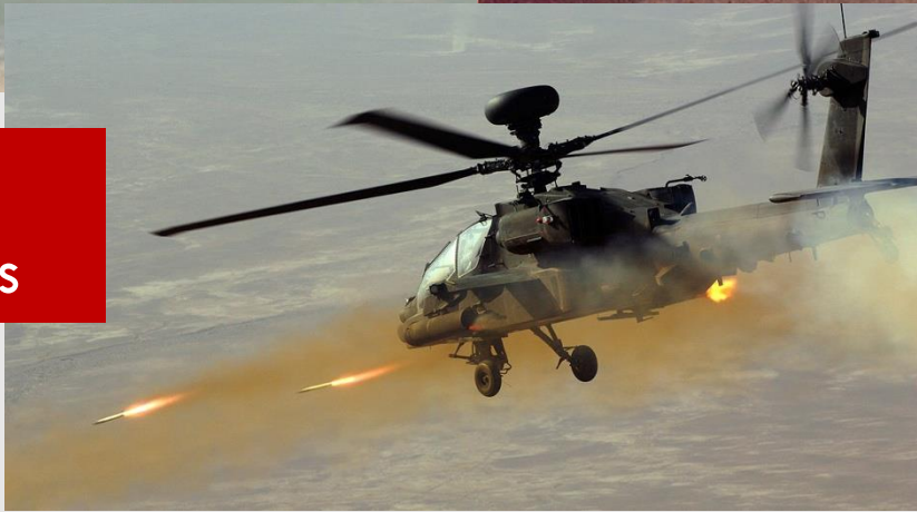
Tails sting like scorpions