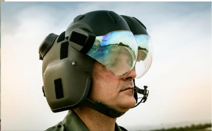
Face of a man