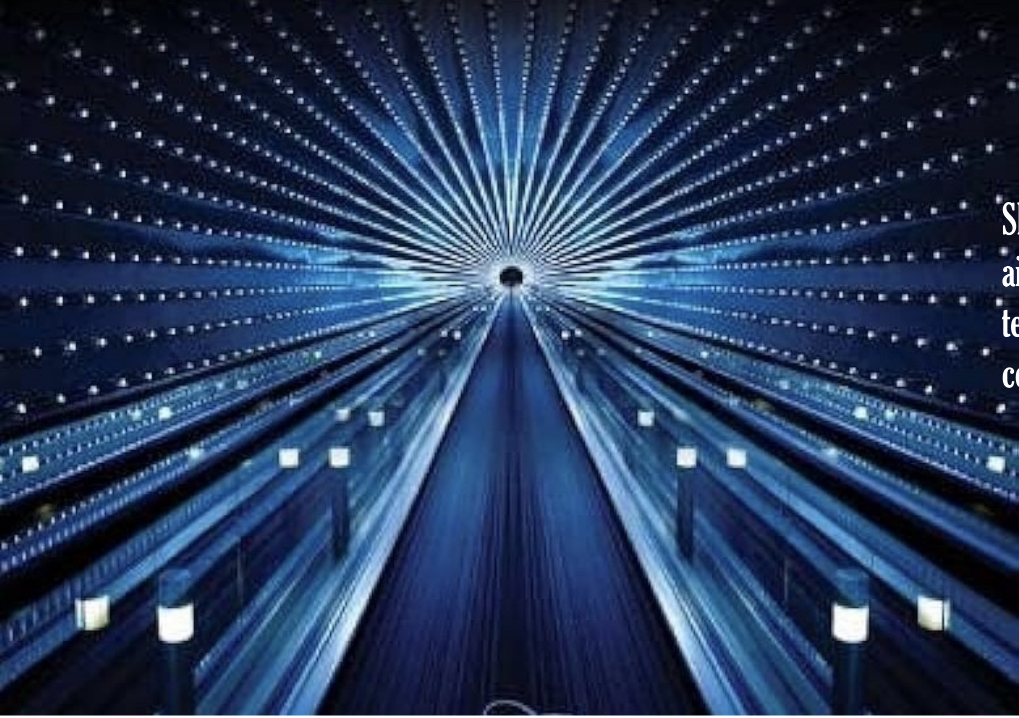
Shanghai airport terminal conveyor walkway