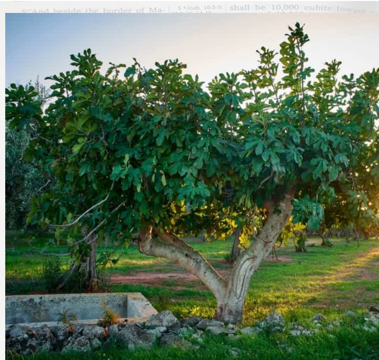
FIG TREES LAST to BLOOM in SPRING