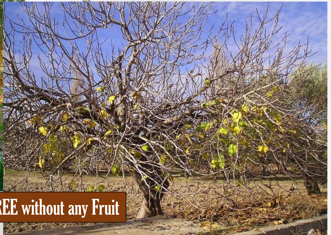
FIG TREE without any Fruit

16" And these shall be its measurements: the north side 4,500 cubits, the south side 4,500 cubits, the east side 4,500 cubits, and the west side 4,500 cubits. 17" And the city shall have open spaces: on the north 250 cubits, on the south 250 cubits, on the east 250 cubits, and on the west 250 cubits. 18" And the remainder of the length alongside the holy allotment